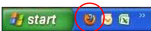
Fig 1: Quick Launch toolbar at bottom left of screen