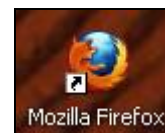
Fig 2: Desktop icon

The screen opens to OSU Extension Service Washington County