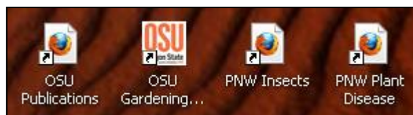
Fig 3: Examples of desktop icons