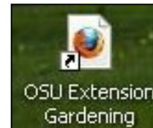
Fig 5: Icon